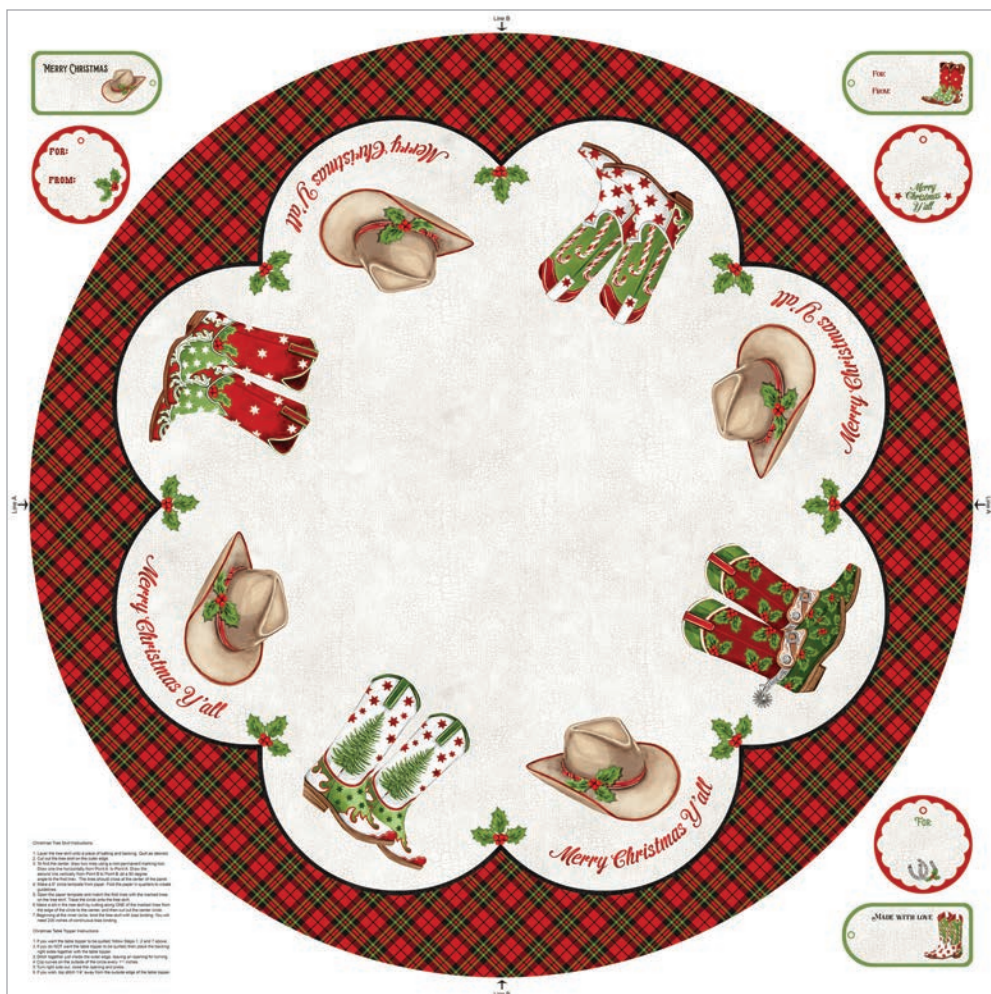
DP24611-11 Cowboy Christmas Tree Skirt Panel-Taupe Multi