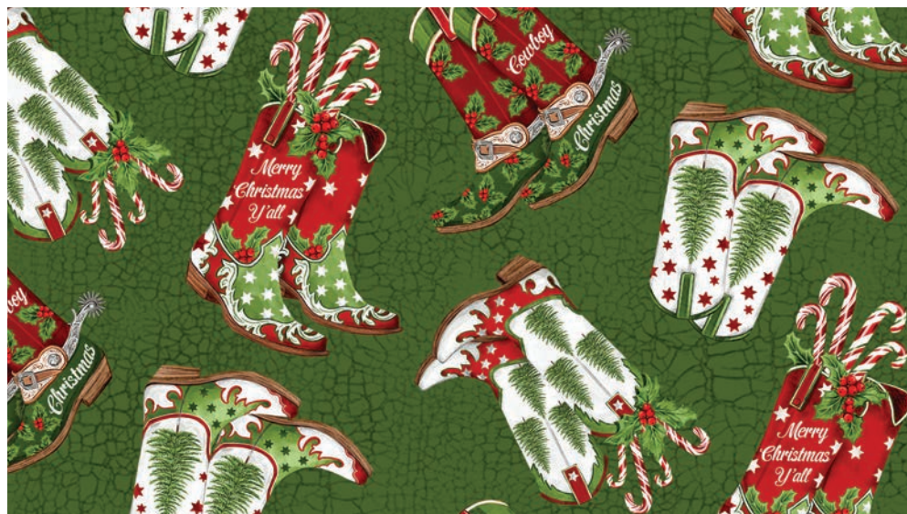
24614-78 Cowboy Boot Toss-Green Multi