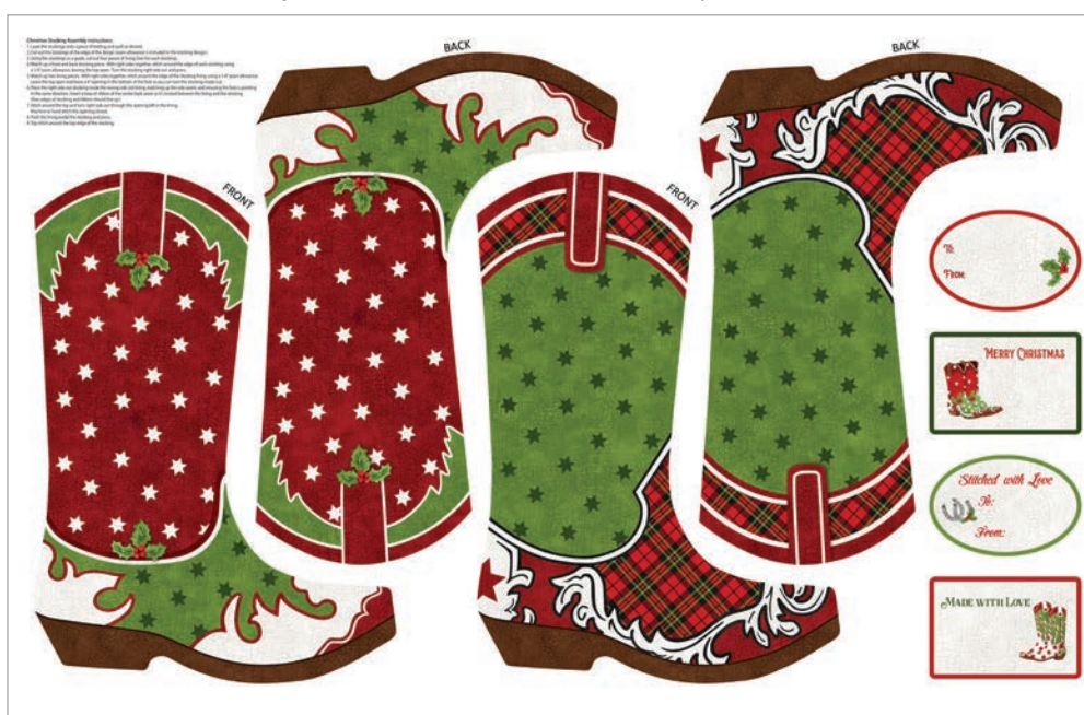
DP24612-11 Cowboy Christmas Stocking-Taupe Multi