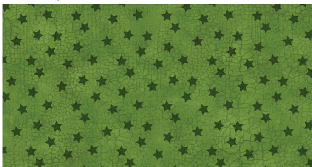
24618-76 Star Toss-Green