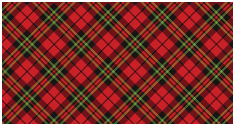
24617-24 Diagonal Plaid-Red Multi