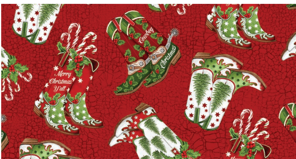
24614-24 Cowboy Boot Toss-Red Multi