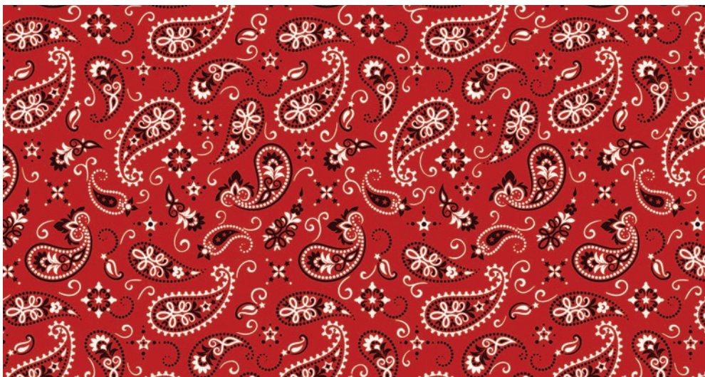
24616-24 Bandana Print-Red