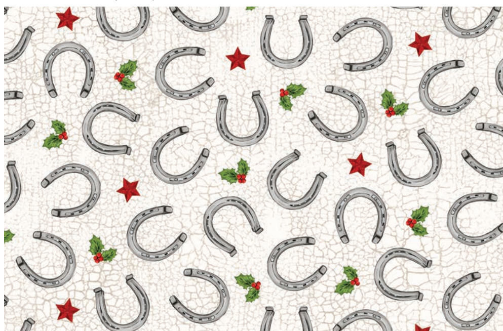
24615-11 Horseshoe Toss-Taupe Multi