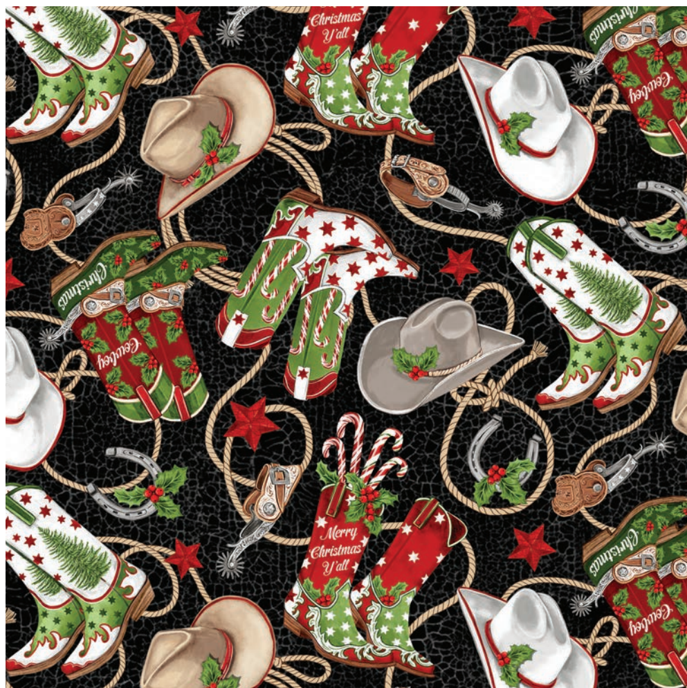
24613-99 Cowboy Paraphernalia Toss-Black Multi