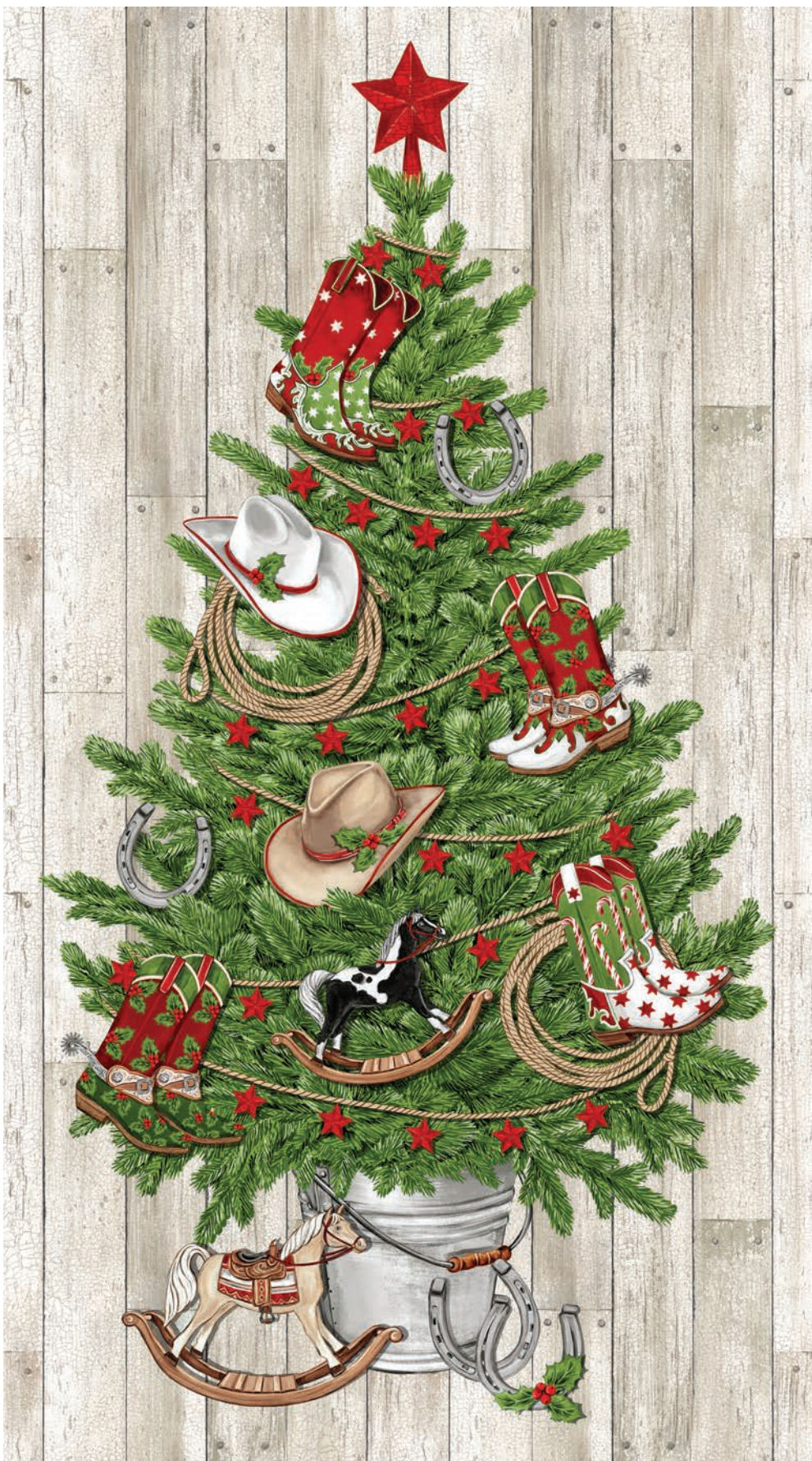
DP24610-11 Cowboy Christmas Tree Panel-Taupe Multi