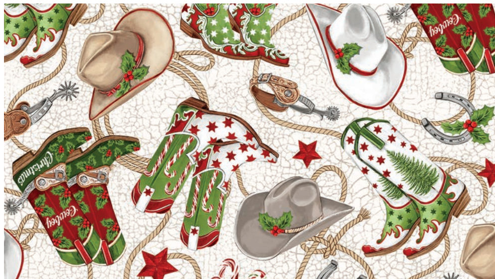
24613-11 Cowboy Paraphernalia Toss-Taupe Multi